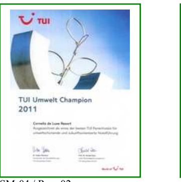
SM-04/Rev. OMWELT CHAMPION