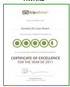
TRIPADVISOR - CERTIFICATE of EXCELLENCE