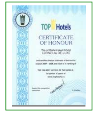
TOP 100 BEST HOTELS - CERT.of HONOUR