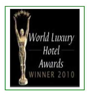
BEST LUXURY COASTAL HOTEL