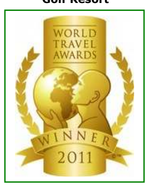
WTA - Europe's Leading Golf Resort