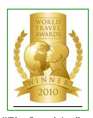
WTA - Europe's Leading Golf Resort