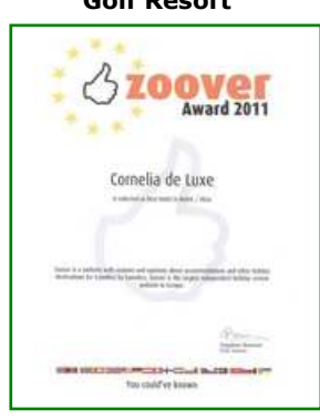
ZOOVER - BEST HOTEL BELEK