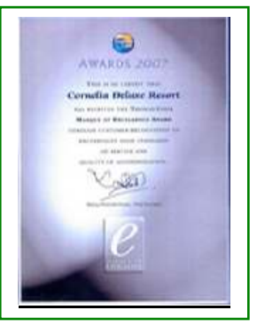
THOMAS COOK - MARQUE of EXCELLENCE