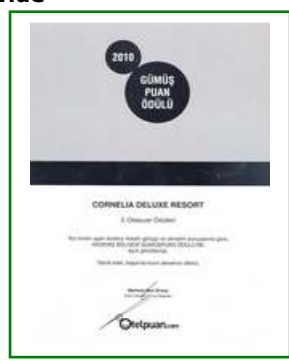
OTEL PUAN - SILVER AWARD