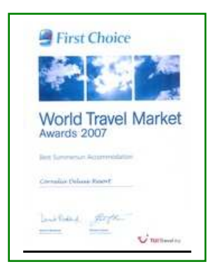
FIRST CHOICE - WORLD TRAVEL MARKET AWARDS