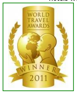
WTA - Turkey's Leading Golf Resort