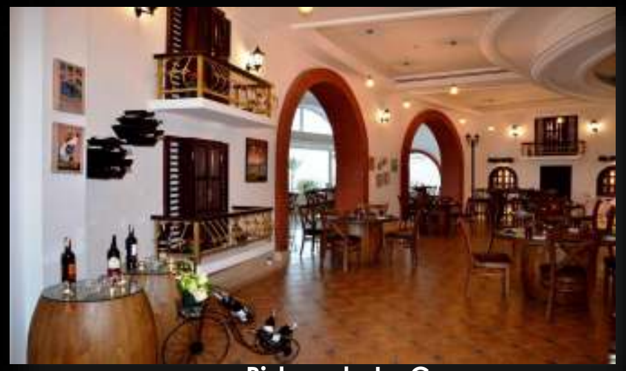
Ristorante La Casa