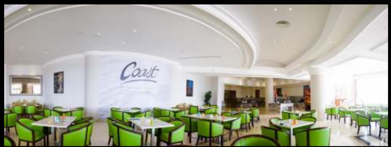
Coast International Buffet Restaurant