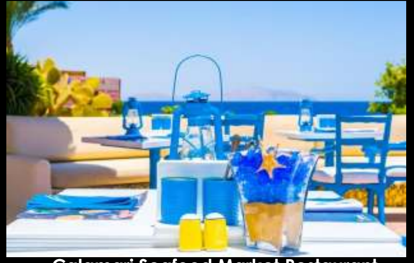
Calamari Seafood Market Restaurant