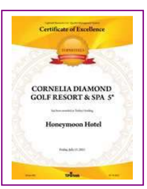
TOPHOTELS - Turkey's Leading Honeymoon