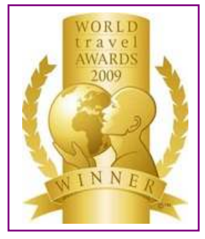
WTA - Turkey's Leading Spa Resort