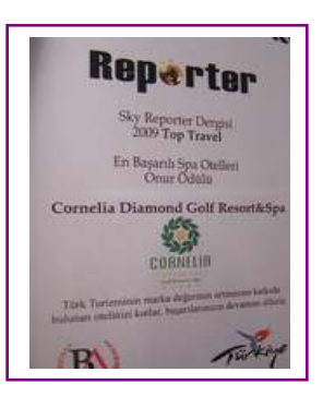
REPORTER MAG. - BEST SPA HOTEL