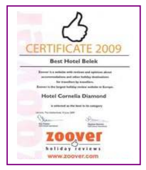
ZOOVER - BEST HOTEL BELEK