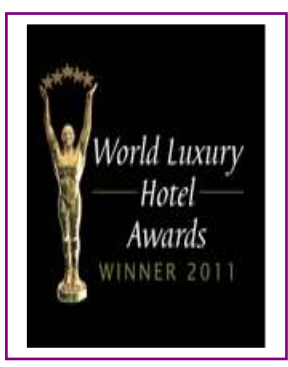
WORLD LUXURY - BEST LUXURY SPA RESORT