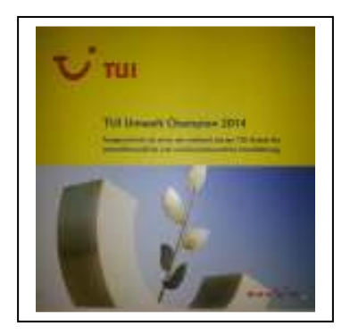
TUI - UMWELT CHAMPION