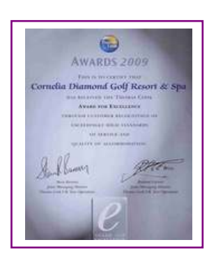
AWARD for EXCELLENCE