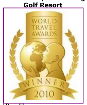
SM-04 Rev N Europe's Leading Luxury Resort