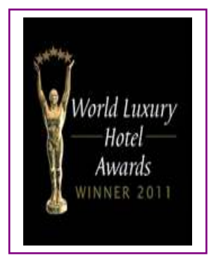
WORLD LUXURY - BEST LUXURY GOLF RESORT