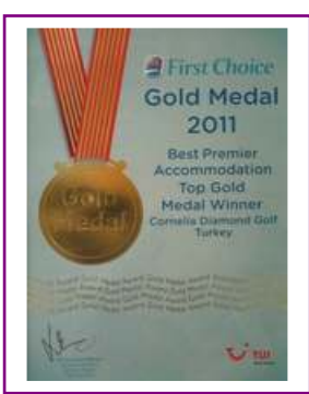
FIRST CHOICE - GOLD MEDAL