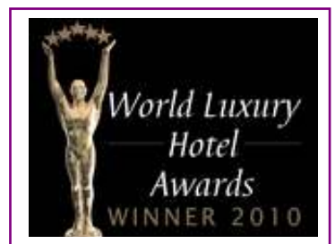
WORLD LUXURY - BEST LUXURY GOLF RESORT