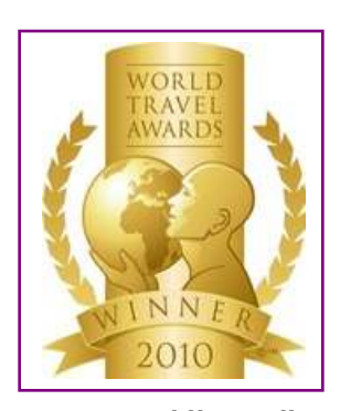
WTA - World's Leading Spar Resortin Celik San. v. Allu Luciusive Golf Resort