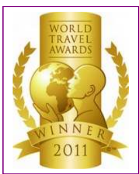
WTA - World's Leading Fully Integrated Resort