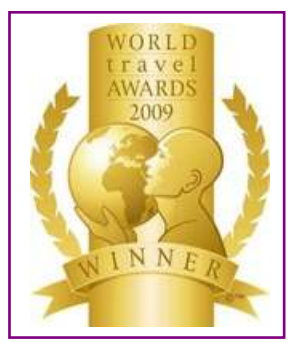
WTA - Europe's Leading Spa Resort