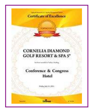
TOPHOTELS - Turkey's Leading Conference