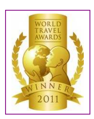
WTA - Europe's Leading Resort Villa