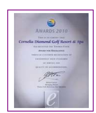
MARK for EXCELLENCE