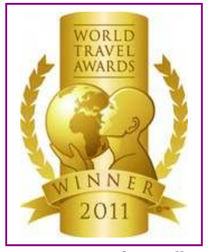
WTA - Europe's Leading Luxury Resort