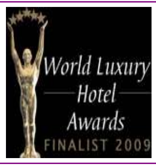
WORLD LUXURY - LUXURY GOLF RESORT