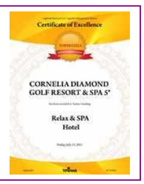
TOPHOTELS - Turkey's Leading Relax & SPA