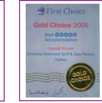
FIRST CHOICE - GOLD CHOICE