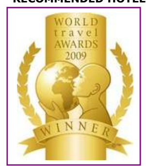
WTA - Europe's Leading