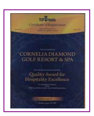
TOPHOTELS - AWARD for EXCELLENCE