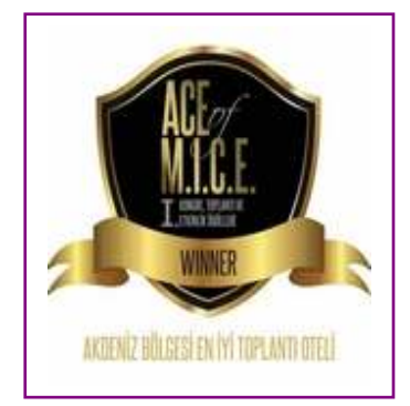
ACE of MICE – Best Congress Hotel in Antalya