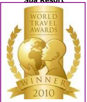
WTA Europe's Leading