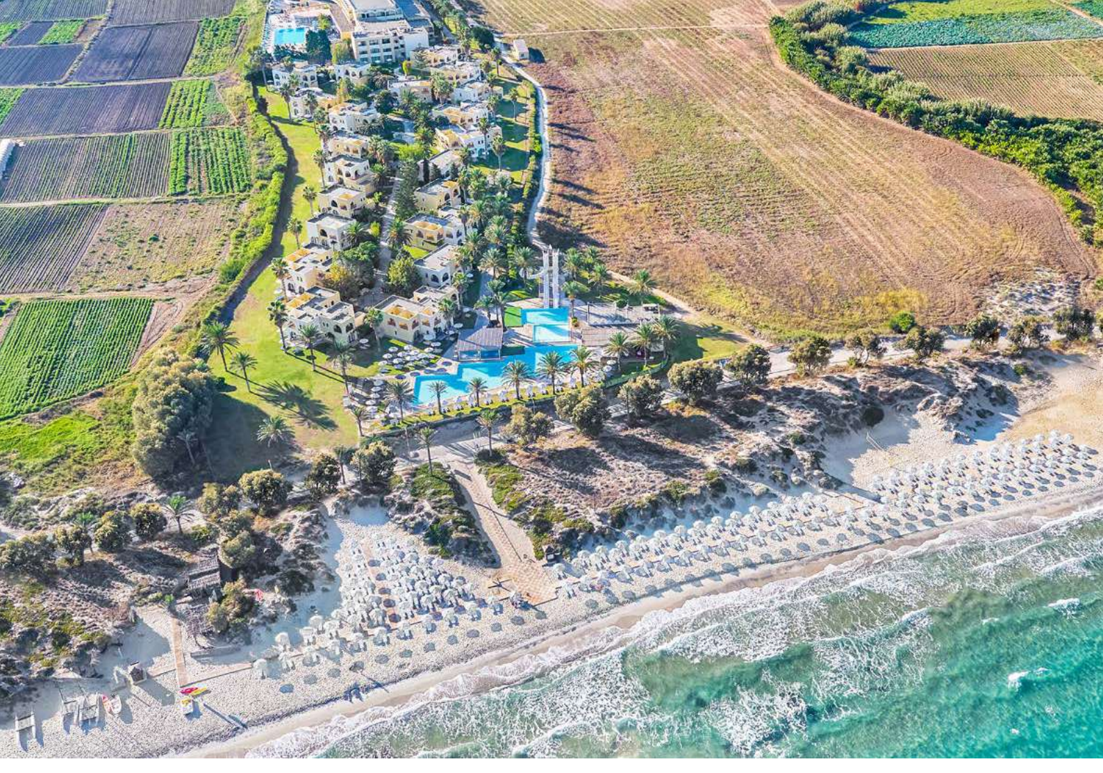
ON A DUNES BEACH, WITH ITS OWN PALMERAI, NEXT TO FARMERS FIELDS.