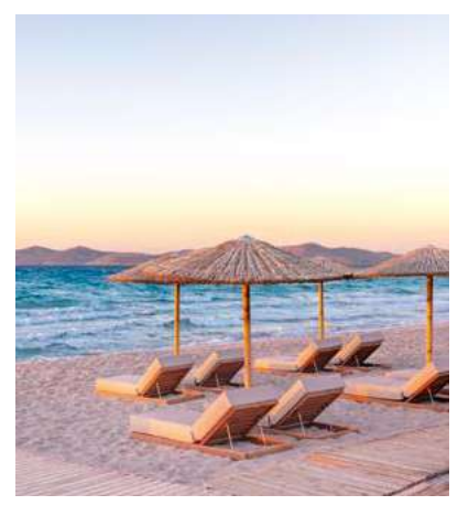
On Marmari famous beach for its sandy expanse and gently shelving waters.

Extra charge: Tennis Lessons for children & adults, Swimming lessons for Kids, Billiards, Watersports School with lessons and equipment rental: Windsurfing, Sailing, Catamaran, Kitesurf, Mountain Bike Centre near the hotel, Horse-riding nearby